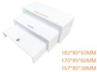
No.6 kubik display stand 04