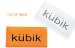
No.4 kubik acrylic display stand