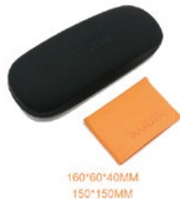
No.12 kubik case with cleaning cloth 04