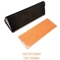
No.10 kubik case with cleaning cloth 02