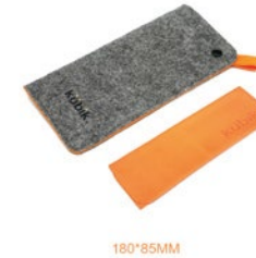
No.9 kubik pouch with cleaning cloth 02