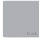
No.3 kubik 250*250mm cleaning cloth 01