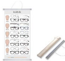
No.7 kubik face shape table 01