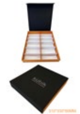
No.15 Kubik Sun Trays 01