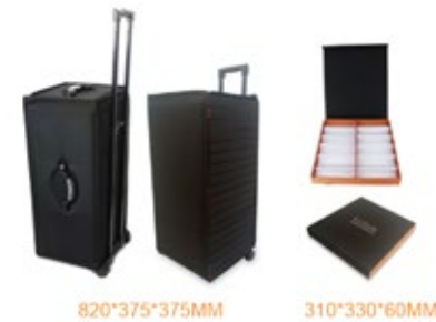
No.14 kubik sample bag 01