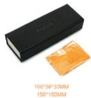
No.11 kubik case with cleaning cloth 03