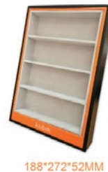
No.13 kubik display trays 02