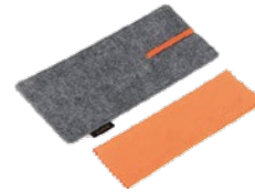
No.8 kubik pouch with cleaning cloth 01