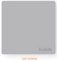
No.16 kubik 300*300mm cleaning cloth 01