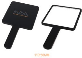
No.1 kubik mirror 01